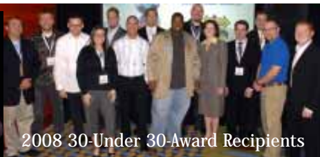
2008 30-Under 30-Award Recipients