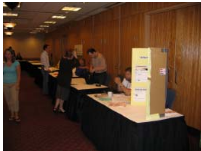
The Brown College-sponsored Job Fair was the most successful in Conclave history!

Proud partners of the 2007 Conclave Learning Conference: Platinum Partner - Radio and Records. Partners - Arbitron, AudioBitXChange/BitXChange, BMI, Brown College, Consolidated Media, Edison Media Research, Envision Radio Networks, Jones Radio Networks, Lincoln Financial Media, McNally-Smith College of Music, McVay Media, Media Span, Megatrax, MusicMaster, Musicrypt/DMDS, Nielsen Entertainment/BDS Radio, Play MPE, Premiere Radio Networks/Mediabase, PromoSuite, RCS, Troy Research and Specs Howard School for Communication Arts.