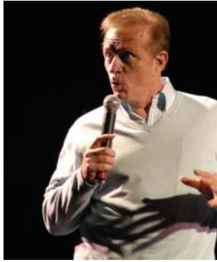
TV icon Bob Eubanks regales the Edison 30 under 30 Luncheon.