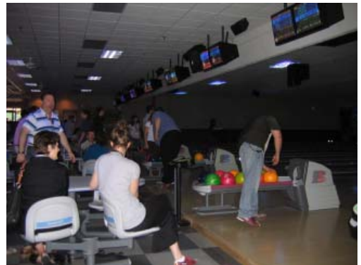
Thousands of dollars worth of prizes, including a big screen TV, were awarded at the annual Bowling Party, sponsored by BDS Radio/Jones Radio Networks.