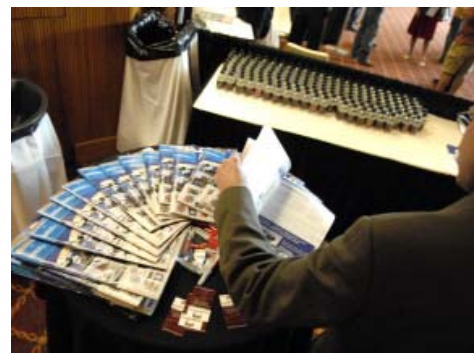
Platinum Partner Radio & Records arrives on the trades table early Friday!

The 2007 TalenTrak: November 10, 2007 • Columbia College, Chicago. Earlybird tuition $39 until 9/1/07. Register at www.theconclave.com