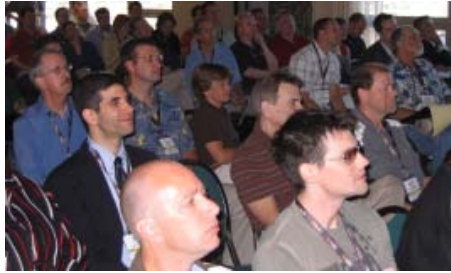
A packed house witnesses Arbitron's PPM Seminar.