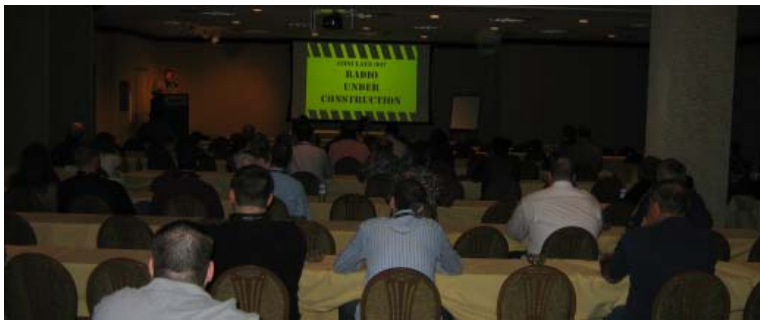
Saturday's Conclave College provided rapid-fire answers to questions of importance, as it always does!