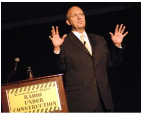
Keynoter Neal Boortz Explained the world with a Libertarian slant.