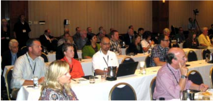
The 37th annual Conclave Learning Conference's Keynote crowd in the MusicMaster Ballroom!