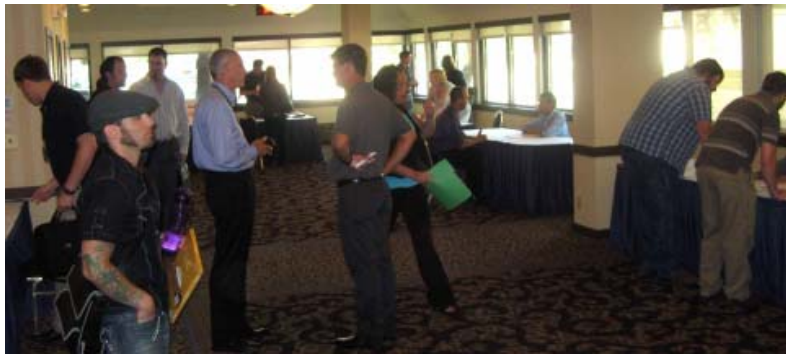
The Brown College Job Fair helped attendees explore new vocational vistas