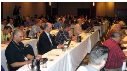
A full house for the Jacobs Media Summer School, sponsored by Envision Radio Networks!