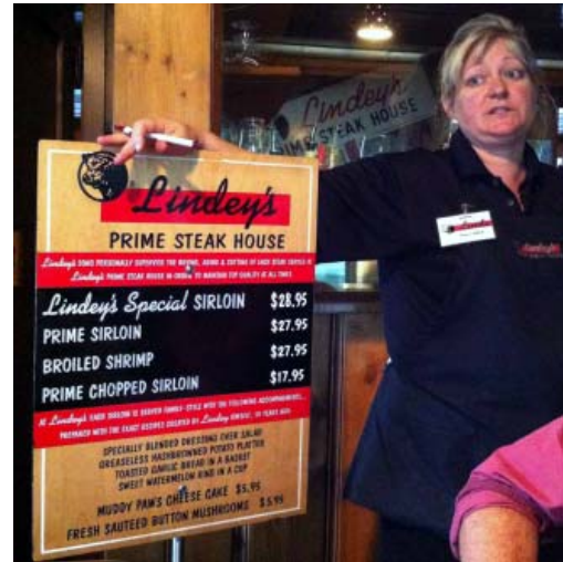
Some spent their Conclave free time in pursuit of fine Twin Cities culinary fare that only cows can provide