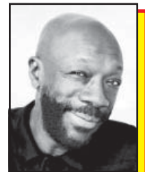
Isaac Hayes Artist/Songwriter

Tuition $299 Student/Free Agent $149 Details at www.theconclave.com