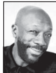
Isaac Hayes Artist/Songwriter