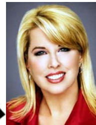
Rita Cosby Author/Commentator Artist/Songwriter

JUNE 25-29, 2008 MARRIOTT CITY CENTER MINNEAPOLIS