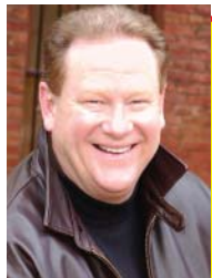
Ed Schultz Jones Radio