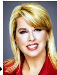
Rita Cosby Author/Commentator

JUNE 25-29, 2008 MARRIOTT CITY CENTER MINNEAPOLIS