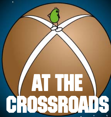
JONES RADIO NETWORK

THE 33RD CONCLAVE LEARNING CONFERENCE JUNE 26-29, 2008 MARRIOTT CITY CENTER MINNEAPOLIS EARLYBIRD TUITION $199 UNTIL 2/29/08! DETAILS AT WWW.THECONCLAVE.COM