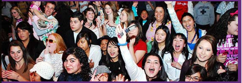
Jupiter Rising performs for hundreds of adoring fans at the KHOP Jiggy Jam last weekend in Modesto!