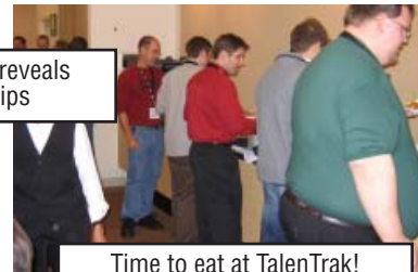
Time to eat at TalenTrak!