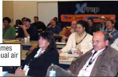
TalenTrakkers gathered at Columbia's University Center are ready to learn!