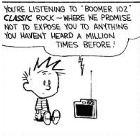
© 1988 Waldman/Colet by Universal Press Syndicate