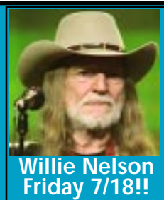
Willie Nelson Friday 7/18!!